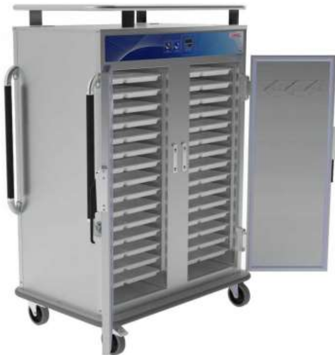
HHC60D Price – 150,000/-

GST @ 18% and Freight charges will be extra at actuals.