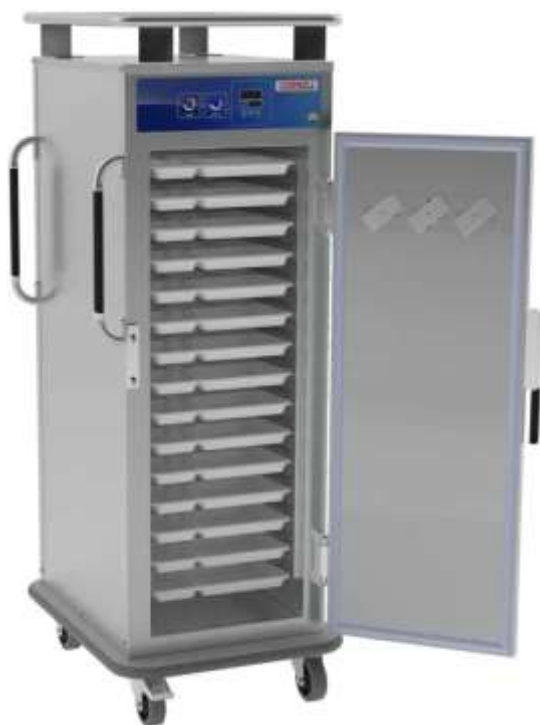
HHC30S Price – 118,750/-

Our noise-free castors allow for silent mobility without disturbing the peace.