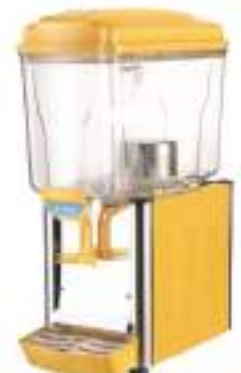
Commercial Single Tank Juice Dispenser Machine 15L Capacity