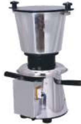
ROUND MIXER GRINDER