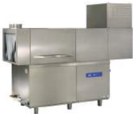
Conveyor Dish Washer Size : 2050 x 800 x 1880