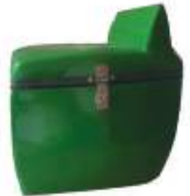
Food Delivery Box