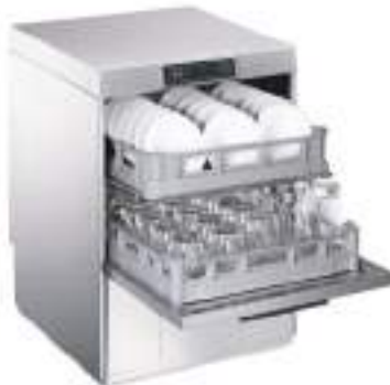
Under Counter Dish Washer Size : 600 x 600 x 820mm Tank Capacity : 24 Ltrs , Crete Size : 500 x 500cm