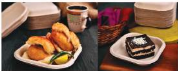
7" Plate 1000 Pcs