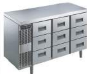
9 Drawers Undercounter Chiller