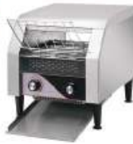
Electric Conveyor Toaster Dimension: 300x420x300(mm) Volts:220-240V, Power:1.5KW