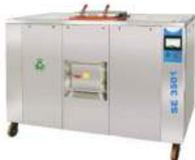
SE 3501 Capacity - 350Kgs