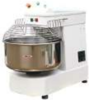
Spiral Mixer - 20 Litres (Double Speed) Dimension: 690 x 380 x 730(mm) Raw Flour : 8 Kgs. Power : 1.1 kw, 220V