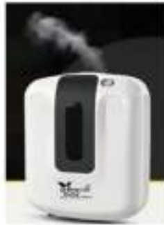
SCENTING SYSTEM WALL MOUNTED