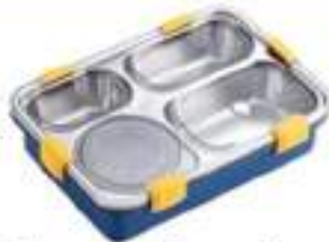
4 Compartment Lunch Box