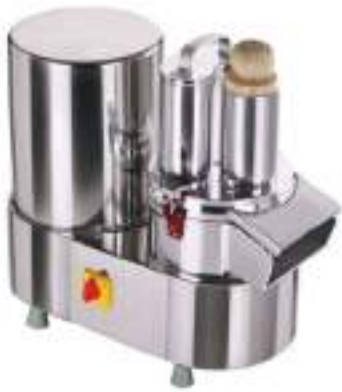
VEGETABLE CUTTING MACHINE