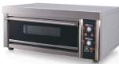
1 Deck/2 Tray Baking Oven Gas Operated Without Steam & Stone, Power : 0.1 kw, 220V, Tray Size : 600 x 400 Dimension: 1350X850X600(mm)