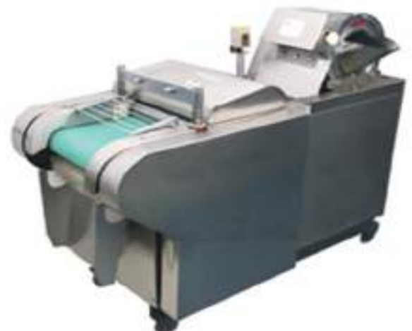
AUTOMATIC VEGETABLE CUTTING MACHINE (WITH 2 AC DRIVES)