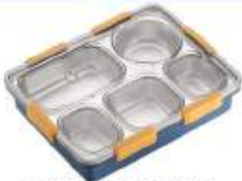
5 Compartment Lunch Box