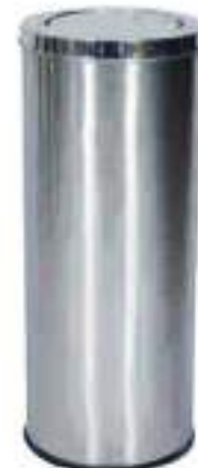
SS Swing Lid