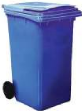
Volume : 120 Litres