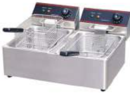
Electric Double Fryer Dimension: 460x580x310(mm) Capacity:12L Volts:220-240V/50-60Hz Power:2.5+2.5KW With temperature control