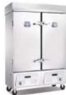
Gas Rice / Idli / Momos / Potato Steamer (w/o tray)- ELITE-GS24