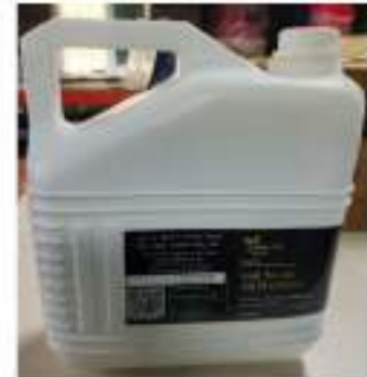
Anti Smoke 5 L