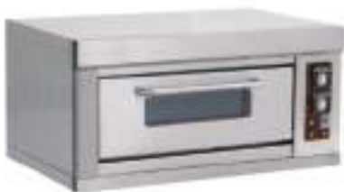
1 Deck/2 Tray Baking Oven Electric Operated, Without Steam & Stone, Power : 6.6 kw, 440V, Tray Size : 600 x 400 Dimension: 1230X820X530(mm)