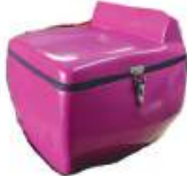
Food Delivery Box