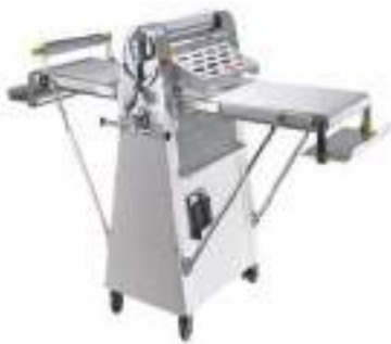
Dough Sheeter-Floor type Dough Capacity : 5.5Kg, Gap Range : 1-40mm Dimension: 900x2700x1100(mm) Power : 0.55 kw, 440V