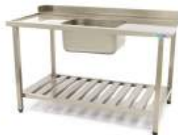
SS Loading Table With Sink With Splash