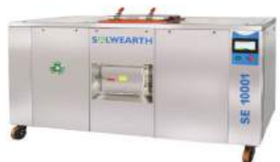
SE 1H Capacity - 1000Kgs