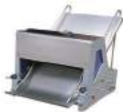
Bread Slicer Dimension: 650X740X780(mm) Power : 0.25 Kw, 220V