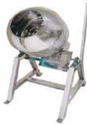
TILTING COATING PAN