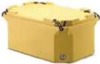
Insulated Ice Boxes

Roto Moulded Pallet 9Leg With Steel Size: 1200 x 1000 x 160