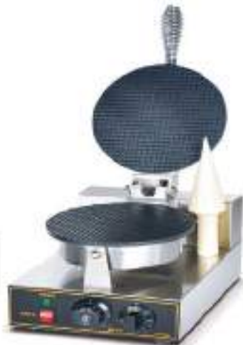
Electric Cone Baker Dimension: 360x250x230(mm) Volts:220V/50Hz,Power:1KW