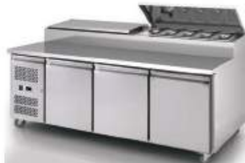
Makeline with Under Counter Chiller

300ltrs Single Door Visi Cooler Gross Capacity : 300ltrs Dimension(WxDxH) : 620 x 595 x 1975 mm