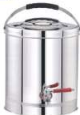
Tea urn Heavy with tap