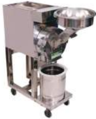
2IN1 PULVERISER (DRY PULVERISER)