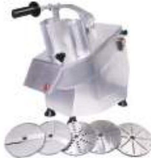
ELECTRIC VEGETABLE CUTTING MACHINE Size: Dimensions: 59 x 27 x 48 Net Weight: 28Kg, Gross Weight: 33Kg