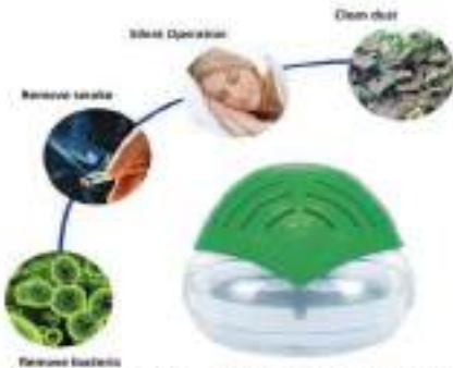
AROMA AIR REVITALIZER JET SERIES