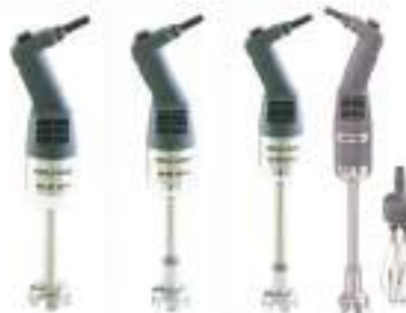
ROBOT COUPE POWER MIXER Speed - 9500 RPM, Power - 500 Watt 2 Tube Length - 450mm Total Length - 840mm Ø 125mm HS CODE - 84386000