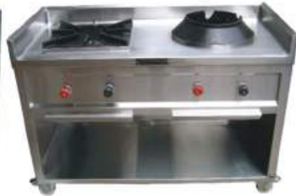
2Burner Chinese Range + Stock Pot Dimension: 45"x24"x30"