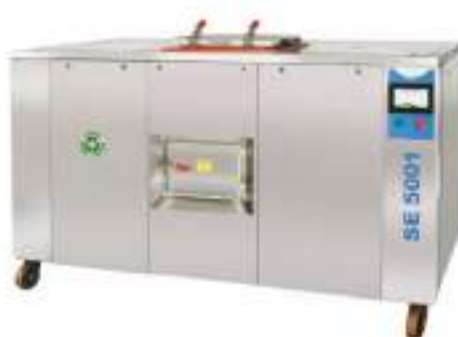
SE 5001 Capacity - 500Kgs