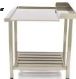
SS UnLoading Table