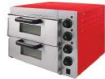
Electric Pizza Oven Dimension: 560x570x440(mm) Volts:220-240V, Power:3KW Weight:33Kg, Each deck for 1*12" pizza