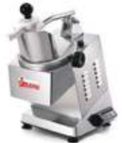
Model - TM 2 SIRMAN - VEGETABLE CUTTER INOX with 6 Blade Power - 515 Watt - 0.7 HP Disc Revolution - 300 RPM