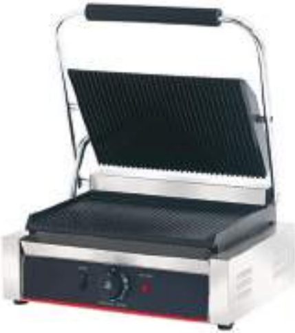
Electric Contact Grill Dimension: 305x400x210(mm) Volts:220V/50Hz,Power:1.8KW