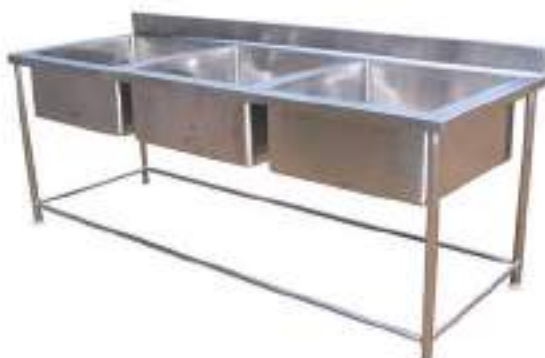
Three Sink Unit Dimension as per requirement