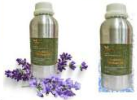
AHU Oil Diffuser Oil