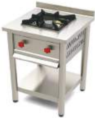
SS Singl Burner Range Dimension: 24"x24"x24"