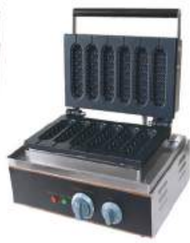
Electric Stick Waffle Dimension: 450x300x245(mm) Volts:220V/50Hz,Power:1.5KW