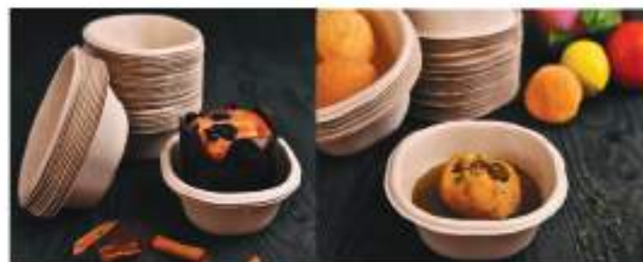
180ml Bowl 1000 Pcs