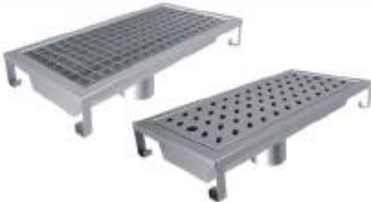
Anti Skid Cover Perforated Cover