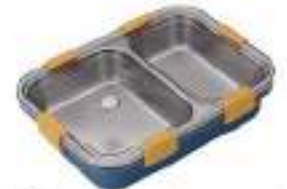
2 Compartment Lunch Box