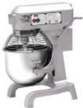
Planetary Mixer - 20 Litres Dimension: 415 x 530 x 780(mm) Raw Flour : 6 Kgs. Power : 0.75 kw, 220V