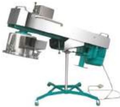
FARSAN (NAMKEEN) MACHINE