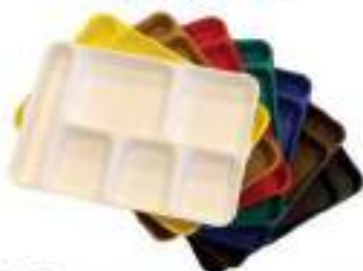
6 Compartment tray