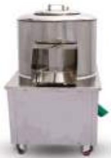
Potato Peeler Capacity : 10, 15, 20 and 30 Kgs