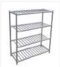
Pot wash rack 4 shelf