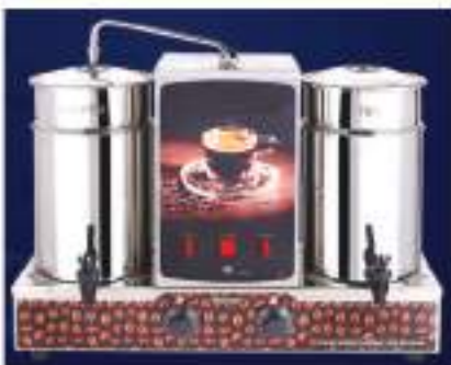
Fresh Filter Coffee & Tea Brewer - CTM220 Coffee Powder 250 grams & Tea Powder 200 grams Water tank Capacity 2 Ltrs