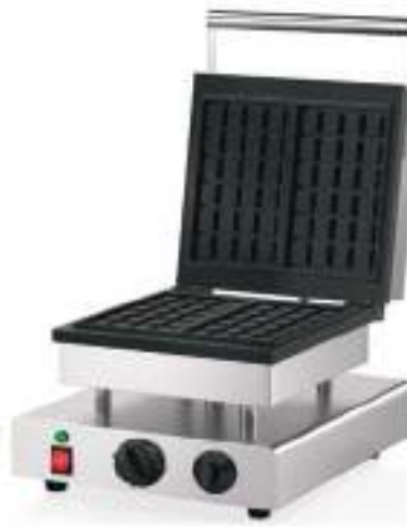
Electric Waffle Baker Dimension: 310x355x240(mm) Volts:220V/50Hz,Power:2KW