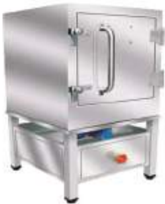
LIVE STEAM DHOKLA