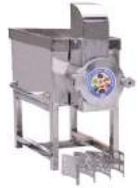
ONION CUTTING MACHINE