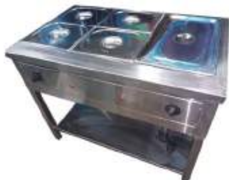
Bainmarie with 4 Compartment Dimension as per requirement