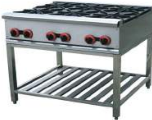
SS Six Burner Range Dimension: 45"x33"x48"