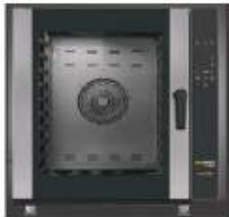
ModelHECME6 Dimensions(mm)890W x 890D x 720H Weight(Kg)120, Power(V)415, Power(Amps)13.7 Power(Phase)3, Power(k W)9.5 Brand Hobart ( Germany )