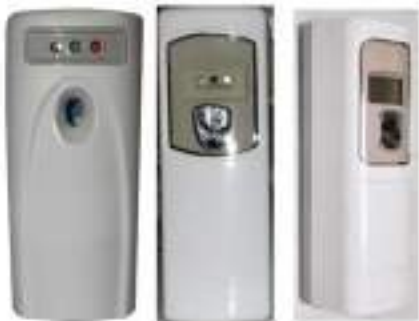
AUTOMATIC AEROSOL DISPENSER