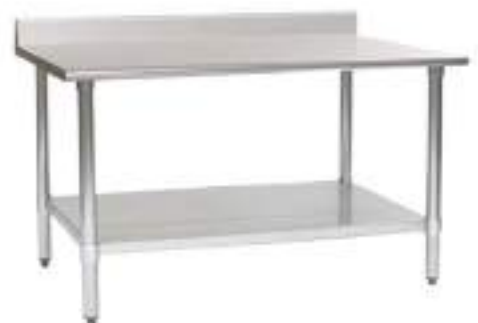
Working Table Dimension as per requirement