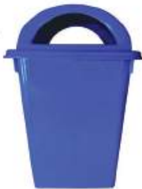
Volume : 90 Litres