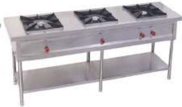
SS Three Burner Range Dimension: 72"x28"x30"