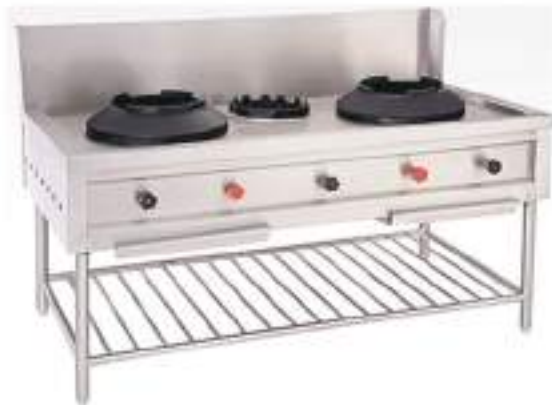
2Burner Chinese Range + Stock Pot Dimension: 72"x28"x30"