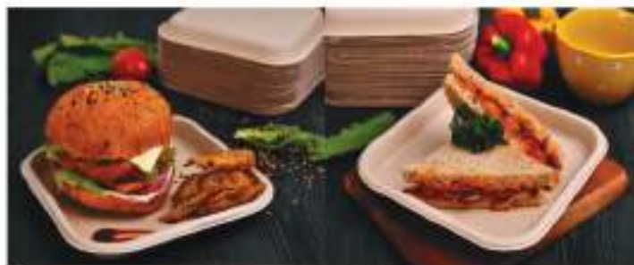
9" Plate 500 Pcs