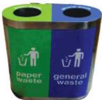
SS Dustbin Duo 60L x 2