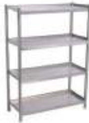
Storage rack 4 shelf