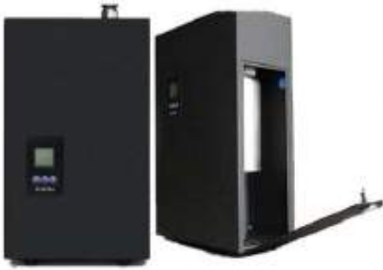
SCENTING SYSTEM AHU