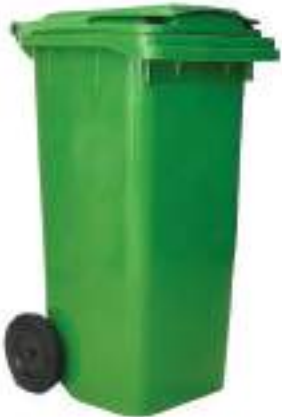
Volume : 240 Litres