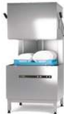
HOOD TYPE DISHWASHER Size: W 635 x D742 x H 1.480 (1.960) mm Loading height: 440 mm, Rack Size: 500 x 500 mm