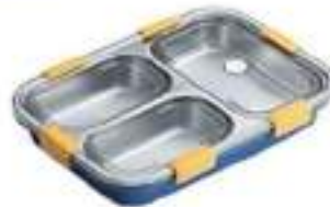
3 Compartment Lunch Box