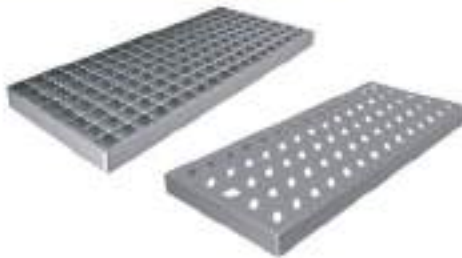
Anti Skid Cover Perforated Cover