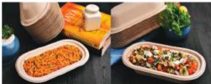
500ml container 1000 Pcs