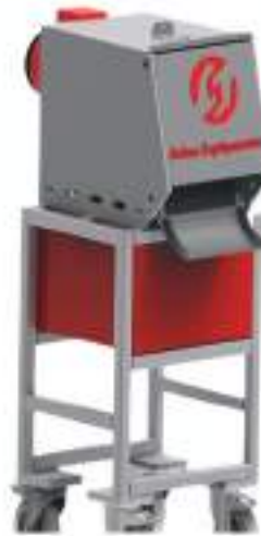
Automatic Chapati Pressing Machine