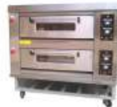
2 Deck 4 Tray Electric Oven Size: 1260 x 850 x 1250 Power: 380V/50Hz/12.6KW N/G Weight:188/208 Details:Tray size: 400*600mm