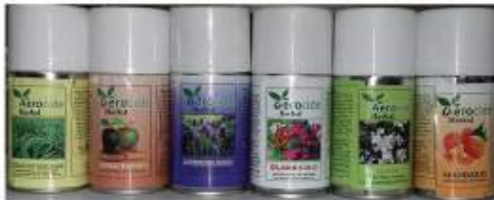
Anti Bacterial Air Sanitizer