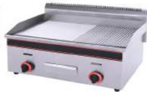
Gas Griddle - 1/2 Flat & 1/2 Ribbed Dimension: 600X590X500(mm) Plate Thickness : 12