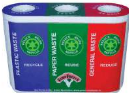
SS Dustbin Duo 60L x 3