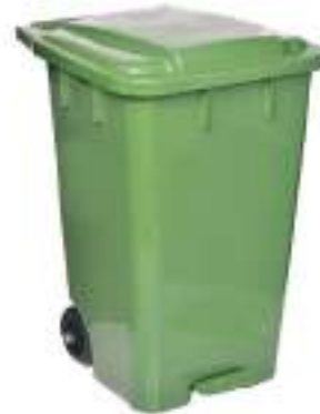
Volume : 35 Litres