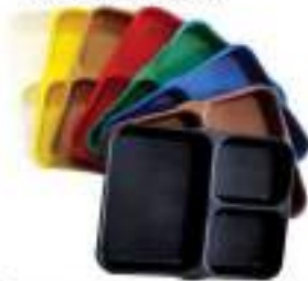
3 Compartment tray