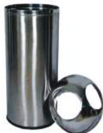
SS Dome Lid