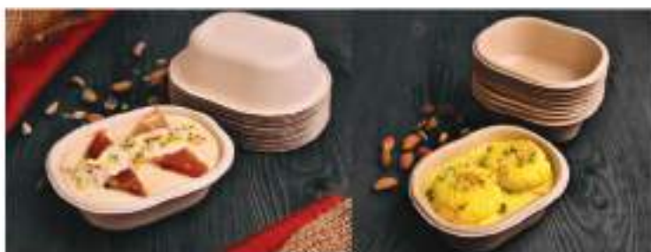
250ml Bowl 1000 Pcs