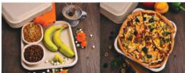
11" Plate 500 Pcs