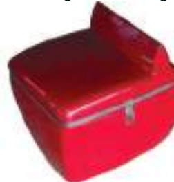
Food Delivery Box