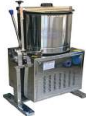
TILTING WET GRINDER