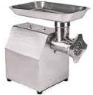
Electric Meat Mincer