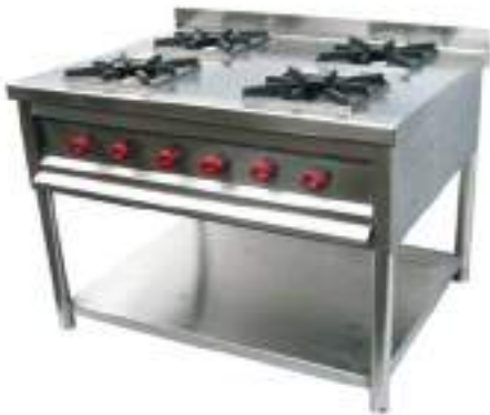
SS Four Burner Range Dimension: 30"x30"x36"