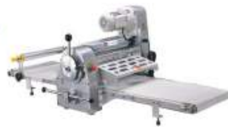
Dough Sheeter-Table type Dough Capacity : 5.5Kg, Gap Range : 1-40mm Dimension: 910x1890x590(mm) Power : 0.55 kw, 440V