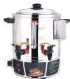
Milk Boiler Capacity: 5 Litres