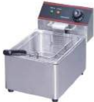
Electric Single Fryer Dimension: 460x280x310(mm) Capacity:6L Volts:220-240V/50-60Hz Power:2.5KW With temperature control