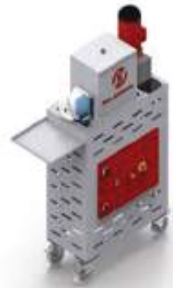
Dough Ball Cutting Machine