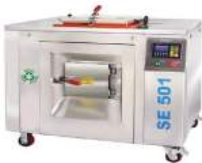
SE 501 Capacity - 50Kgs