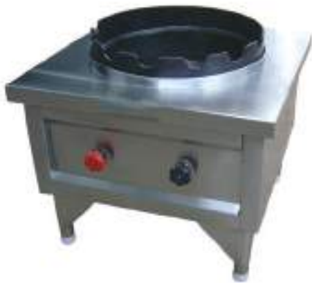
SS Singl Burner Chinese Range Dimension: 24"x24"x24"