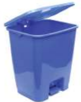
Volume : 25 Litres