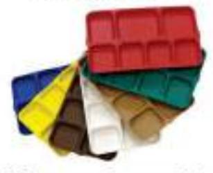
7 Compartment tray