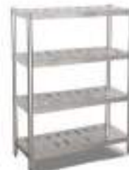
Storage rack 4 shelf perforated