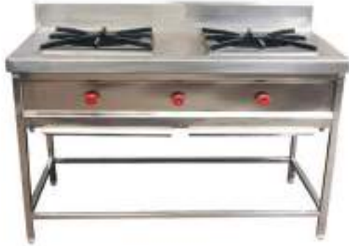
SS Two Burner Range Dimension: 45"x24"x30"