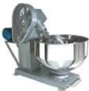
Dough Kneader Capacity : 5, 10, 15, 20, 25, 40 and 50 Kgs