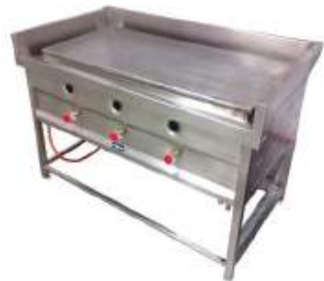
Dosa Tawa Dimension : 48"x24"x36"