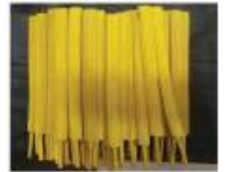
GARDEN INCENSE STICKS