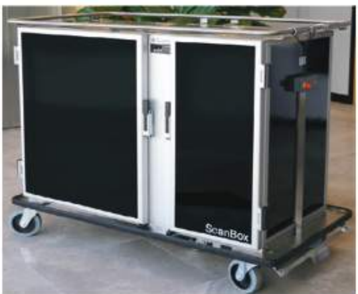
TrayLine Room Service A20+H10