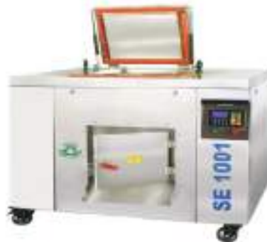
SE 1001 Capacity - 100Kgs