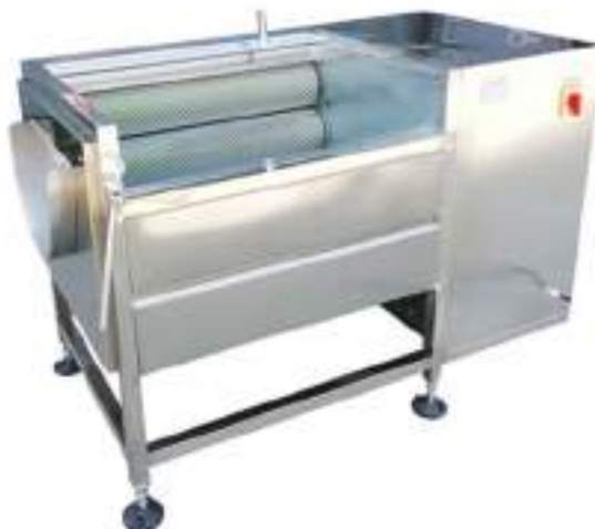
VEGETABLE WASHING AND PEELING MACHINE